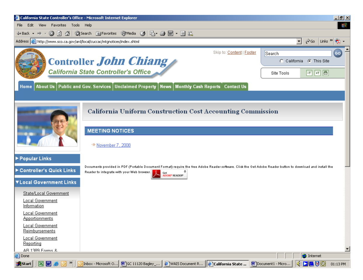
New Location for Meeting Notices