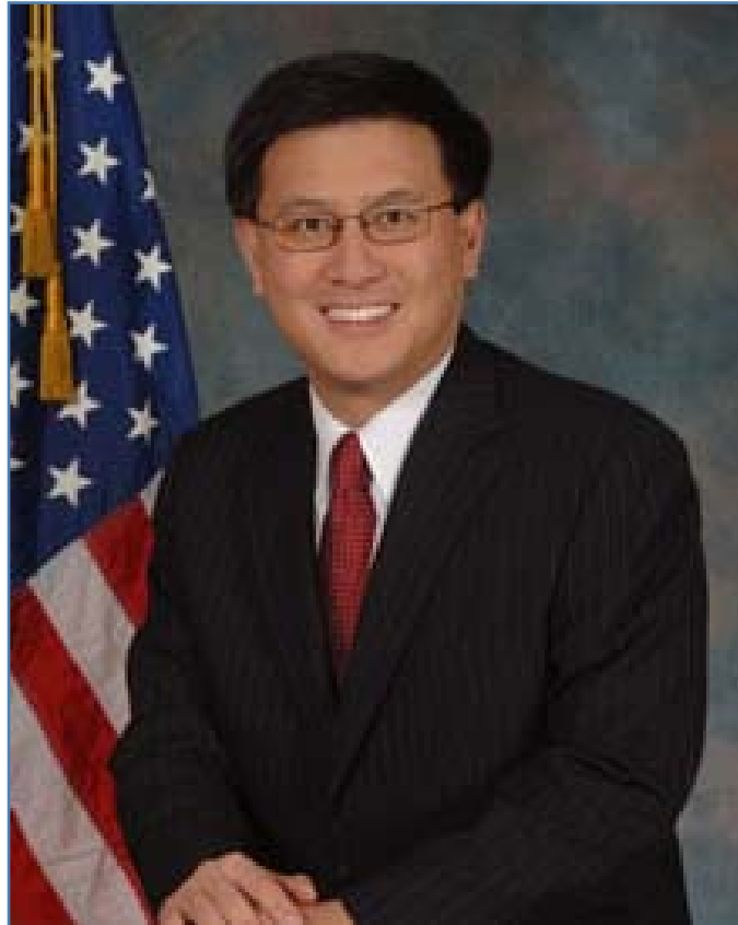
JOHN CHIANG California State Controller